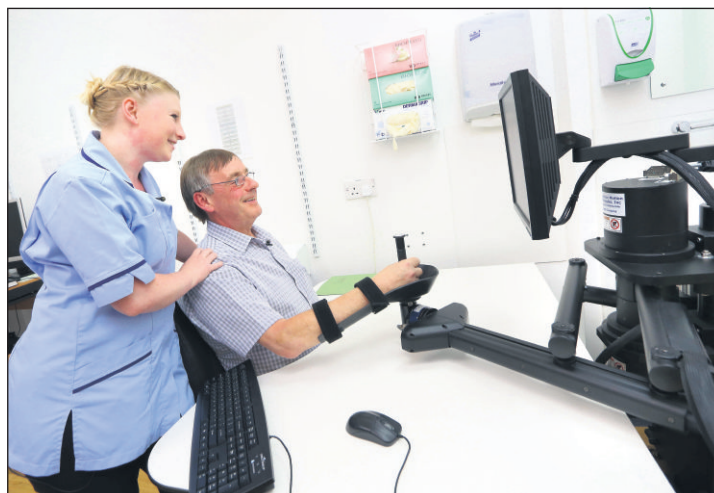
Northumbria Healthcare is leading a study using a rehabilitation robot which may help people recover from arm weakness following a stroke.

"But not all research is about trying new medicines. For example, we are currently leading on a study using a rehabilitation robot which may help people recover from arm weakness following a stroke.