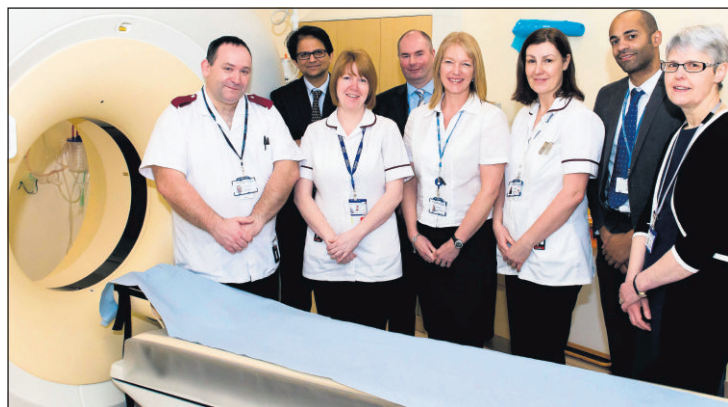
The team with the new CT scanner at Hexham hospital which is one of the most advanced pieces of diagnostic equipment available in the NHS.

F OLLOWING the installation of the new CT scanner at Hexham General Hospital, more people are being able to receive diagnostic tests closer to home.