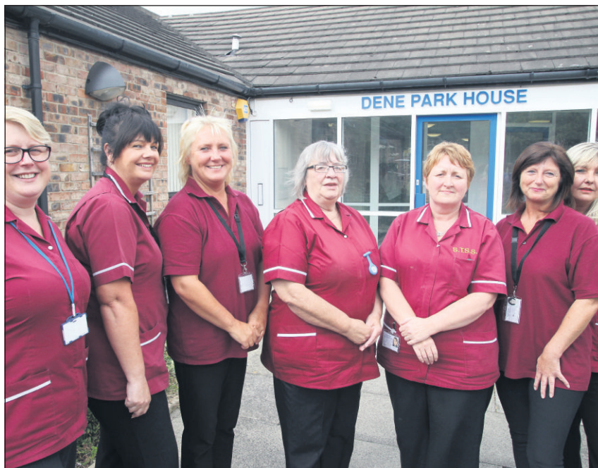
Members of the short term support service in Hexham.

"Our community-based teams work very closely with hospital colleagues, care managers and district nurses to make sure care is as streamlined as possible and that every elderly person gets timely help and support to aid with their recovery."